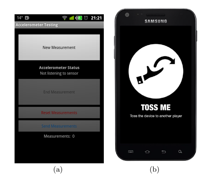
Figure 2: Graphical user interfaces of (a) the test application, and (b) one of Catchy's mini-games.

These games can also be deployed, for example, like the game 'truth or dare', and be used during parties.