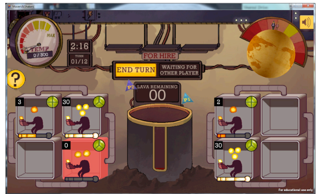
Figure 2: CEO perspective in Movers and Shakers

help them work more efficiently and effectively together. The player spends lava to improve communication between sprites, in turn improving morale. When sprite morale is high enough, the manager receives a badge; this player’s private goal is to earn four badges. Happy workers make the world spin faster; unhappy workers slow it.