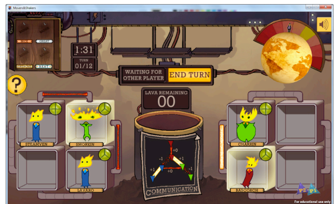
Figure 3: Floor Manager perspective in Movers and Shakers

These mechanics set the players in deliberate, direct conflict with each other, but the game itself requires direct communication beyond the screens to succeed. The physical setup is face-to-face, so that all a player has to do is break out of the game long enough to start speaking with the other player.